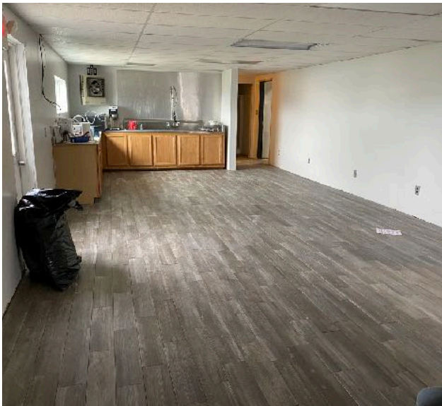
New Flooring - summer 2021

Despite the challenges of COVID 19, the chapter and its many volunteers donating their time and with funds donations from the general membership, we have been able to update the kitchen including a new tile floor throughout the kitchen including the