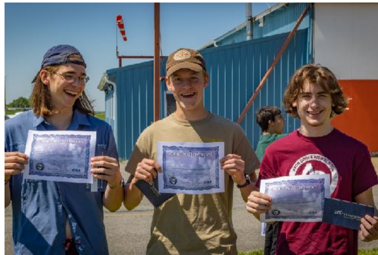
Boy Scout 'Young Eagles'