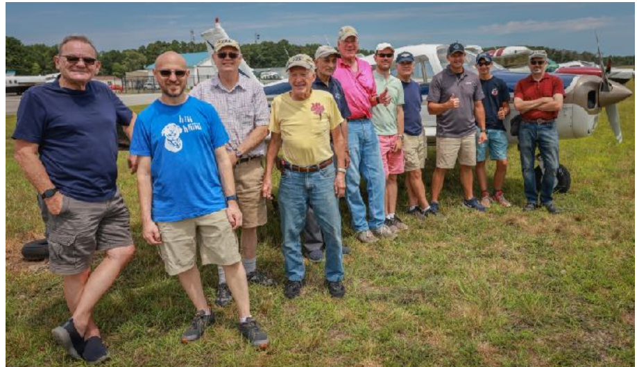
Fly-Out to Delaware Coastal Airport & Restaurant

We received a generous donation from the Stott Foundation, which allowed us to offer the Fred Kacena Scholarship Awards this year. A selection committee reviewed multiple applications, conducted Zoom interviews with the applicants and selected three finalists, with each of them being offered up to $4,000 for their flight training. If you joined us at our September deck party, you had the chance of meeting two of them, and the third one is always involved in the airport community. We're really pleased with our selection for this year, and we're looking forward to 2022 and the next group of future pilots. OC.